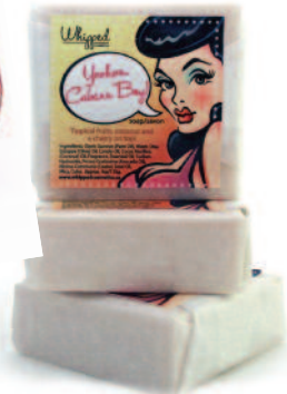
Luxurious soaps by Whipped Cosmetics