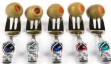
Funky kitchen accessories by Swirly Spoons